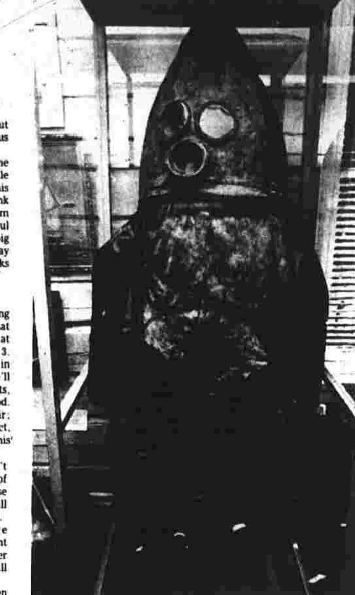
WHAT BIG EYES sea divers had two centuries back, judging from this antique piking suit on display in the harbor town of Rauma in southern Finland.

Thursday we'll have our regular kitchen social bingo games in the afternoon it will be our popular pinocche games. In October we will start serving a noon lunch.