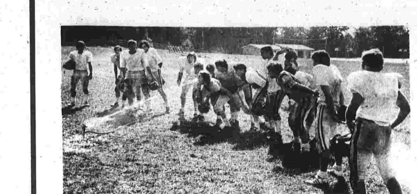
East Catholic Gridders Take Time Out to Quench Thirst