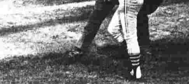
Detroit Manager Martin Protests But Wins Up Being Ejected

Today's Games Boston (McGlothen 6-5) at Cleveland (Perry 19-15) Milwaukee (Lomborg 12-9) and Chicago (Foster 4-1) at Kansas City (Odom 13-4) and Alexander 5-8) Minnesota (Goltz 3-1) at Texas (Nelson 9-4) New York (Gardner 6-2) at Detroit (Coleman 15-12), N. Sunday's Games Boston (McGlothen 6-5) at Cleveland (Perry 19-15) Milwaukee (Lomborg 12-9) and Chicago (Foster 4-1) at Kansas City (Odom 13-4) and Alexander 5-8) Minnesota (Goltz 3-1) at Texas (Nelson 9-4) New York (Gardner 6-2) at Detroit (Coleman 15-12), N.