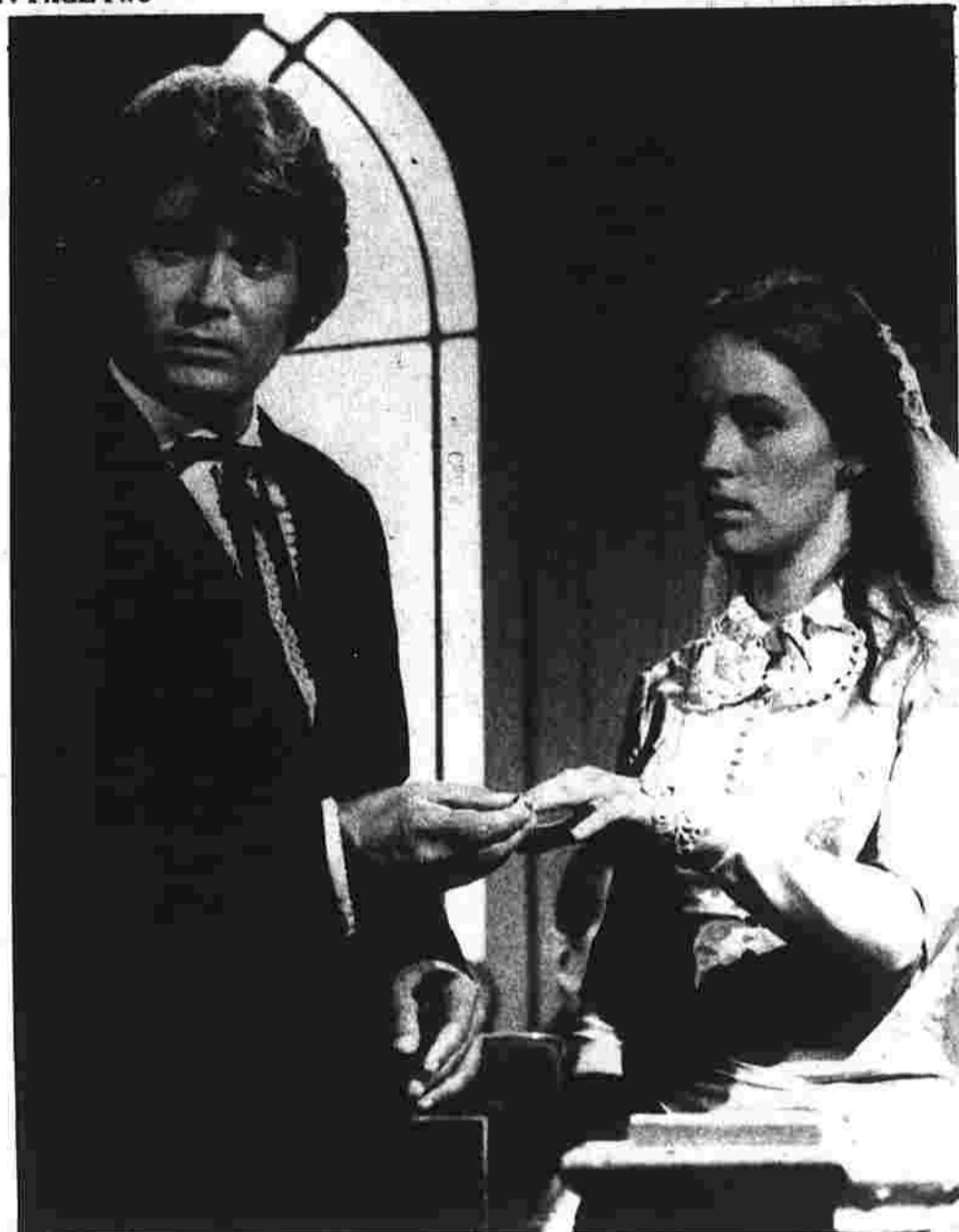
Joe Cartwright (Michael Landon) slips the ring on the finger of Alice Harper (guest star Bonnie Bedelia) as the two are married in "Bonanza" Tuesday, Sept. 12, on NBC (8 p.m.).